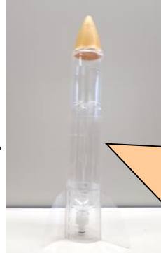
2018 Water Rocket No. 2

In the can sat Koshien, gunpowder is used in the production of rockets. make to learn the basics of rocket.